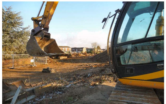
Removal of trees Cotswold Avenue