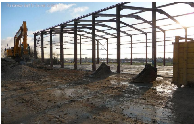
The Skeleton Shell of the new Building

The old cladding has been removed to reveal the steel skeleton of the new build. There is major effort of recycling taking place, all the concrete dug up will be broken up on site to go back as bases for various areas, the trees that have been removed which were in a tangled mess, these will all go for recycling and with their removal new and healthy trees will be planted which will be of a native species such as Oak, Ash, Small leaved Lime, Birch, Wild Cherry, Scot's Pine and Hawthorn.