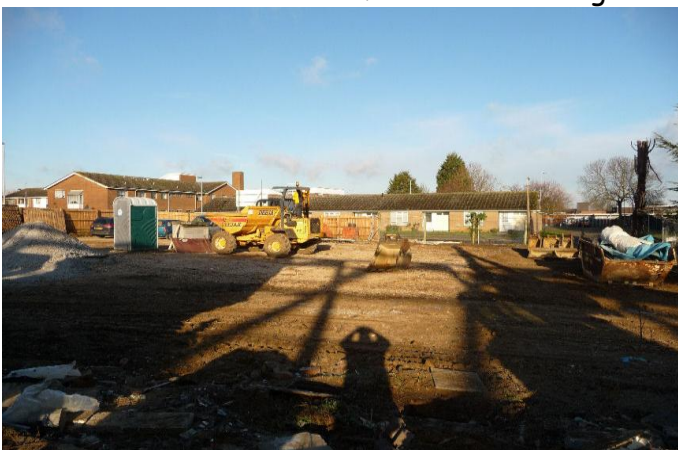
Another view of Cotswold Avenue