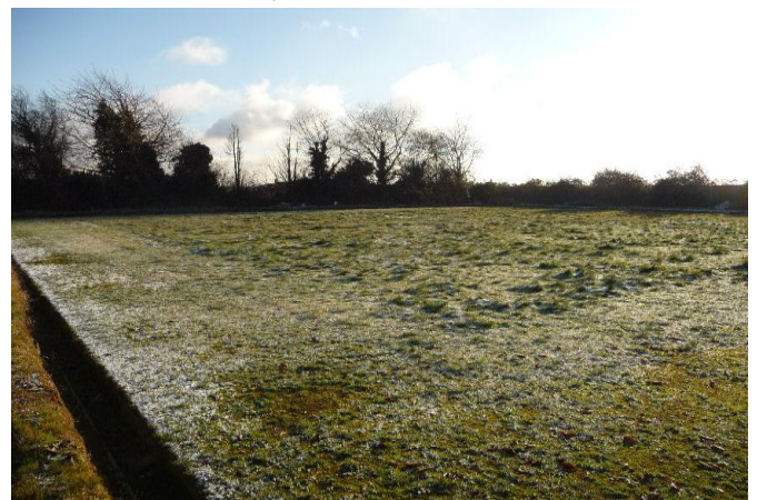
The Bowling Green

There will be 2no New Shelters, 2no Storage areas, 2no Seats on existing concrete bases within the fence line.