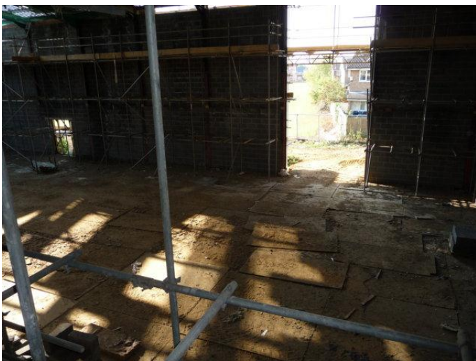
A View of the Hall from the first floor.