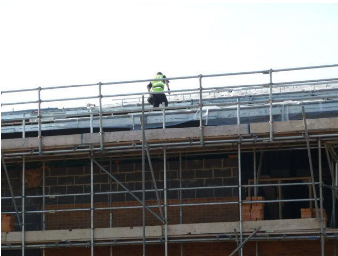
The roofers doing catch-up repairs

Hello we're finally back, with a new builder Steele and Bray who started work on site on the 19th September and work has started to progress again, the third lift scaffold is now up and external brickwork is proceeding nicely. The roofers are on site to repair the weather damage and preparing to complete the roof over the next few weeks. Over the next few months we hope the images will look a bit more exciting.