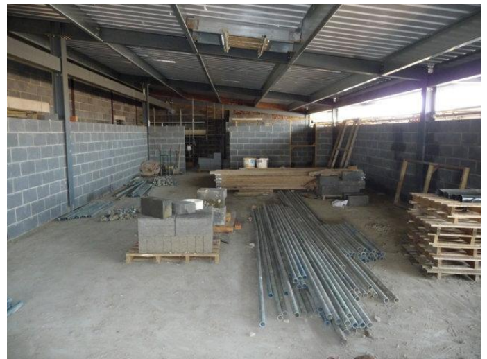
Walls going up in the Archery Range.