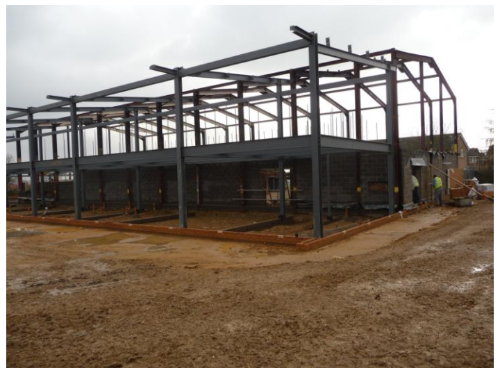
The North East (Front) elevation