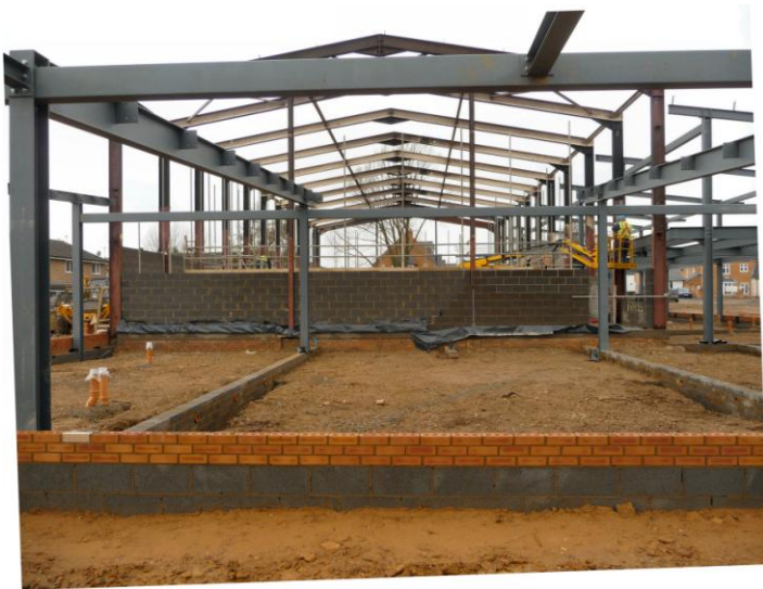
The South East view of the Building

Firstly apologies for the absence of the January Volume this was due to illness. So this volume will be January/February. The structure of the main building is now well underway, as you can see from the doubling of the steelwork and external brickwork also the internal block work.