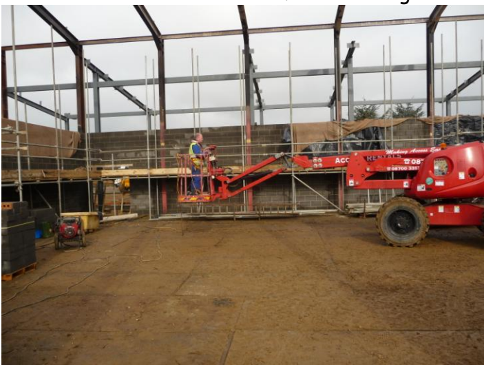
Another view of the Main Hall