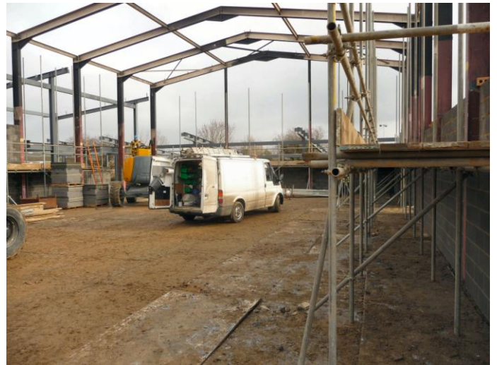
Inside the Main Hall